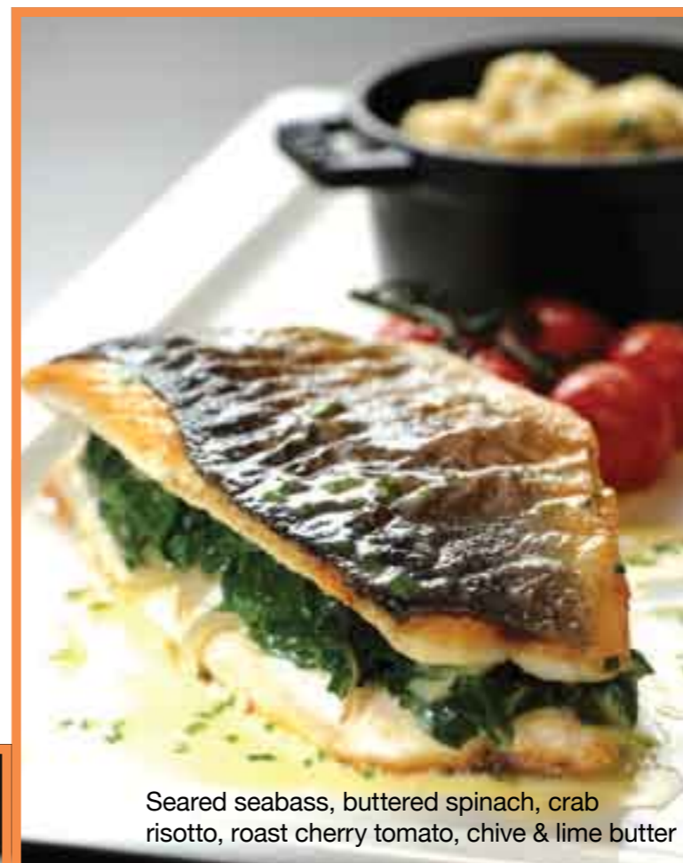
Seared seabass, buttered spinach, crab risotto, roast cherry tomato, chive & lime butter