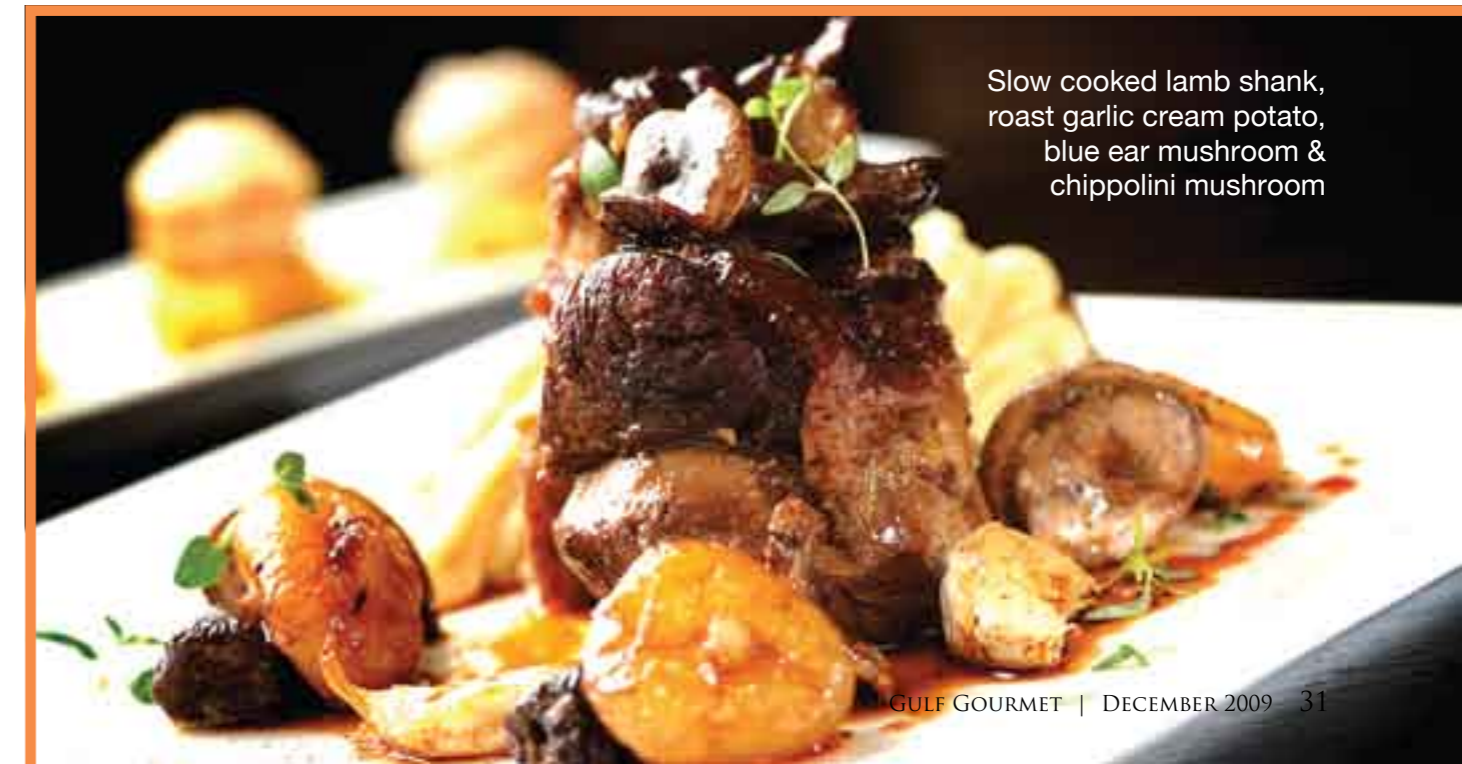
Slow cooked lamb shank, roast garlic cream potato, blue ear mushroom & chippolini mushroom

Starter Pan flashed scallops with laksa noodles, saffron cream & capsicum foam Fish Course Seared seabass, buttered spinach, crab risotto, roast cherry tomato, chive & lime butter Meat Course Slow cooked lamb shank, roast garlic cream potato, blue ear mushroom & chippolini mushroom Dessert White chocolate & basil soup, roast pineapple