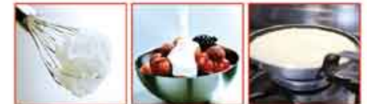
Excellent whipping rate : 2.5 Cold : rich and smooth Not consistent, good reductive qualities