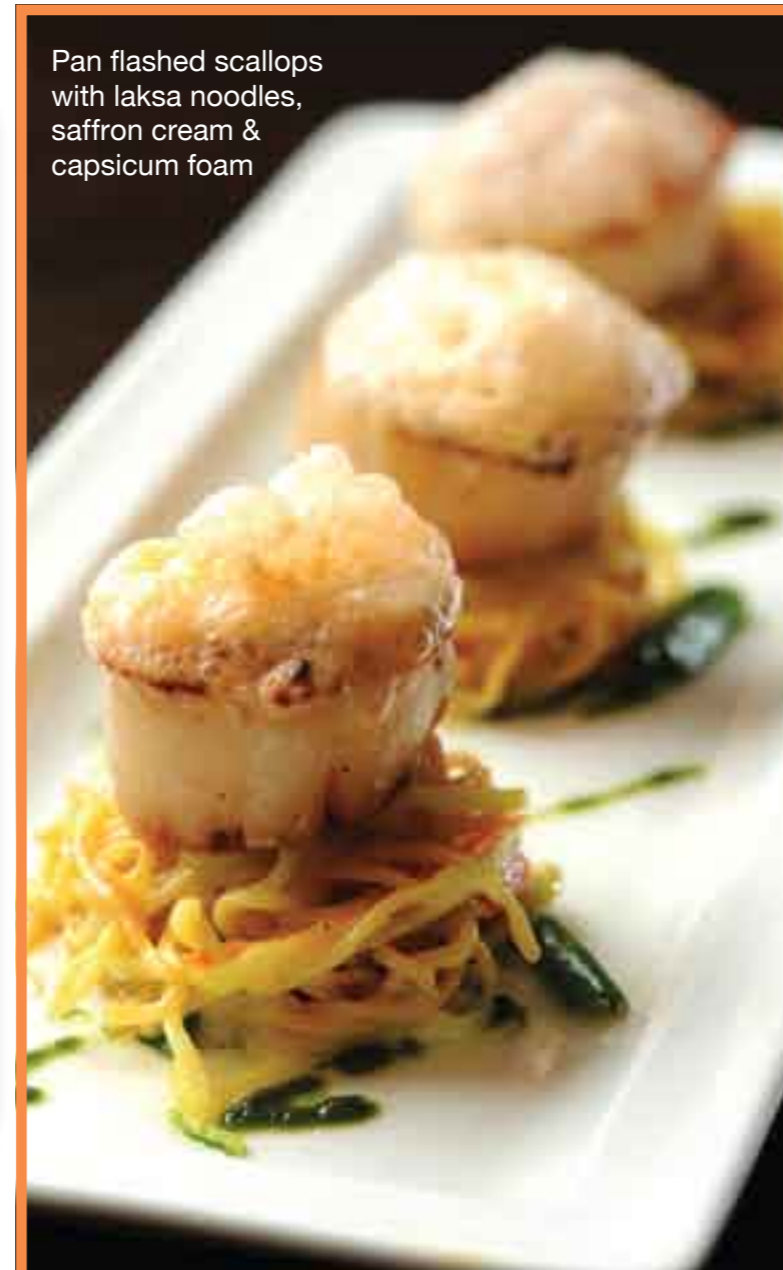
Pan flashed scallops with laksa noodles, saffron cream & capsicum foam