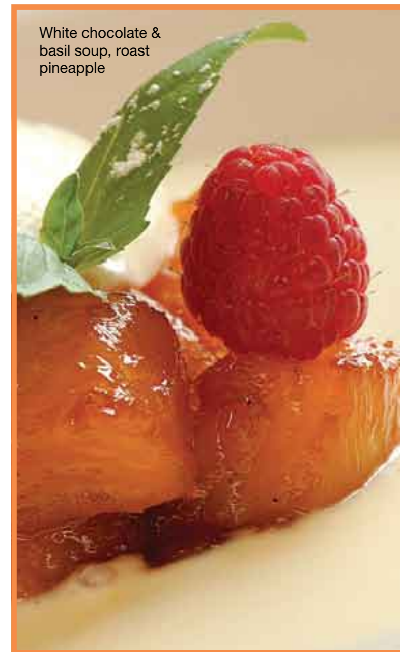
White chocolate & basil soup, roast pineapple