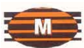
Masterbaker Marketing FZCO